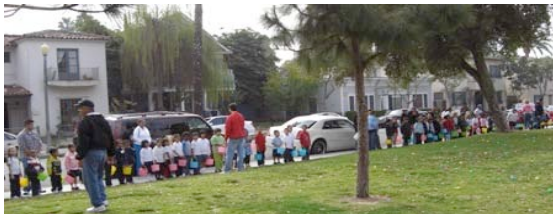
The countdown . . . 1-2-3

On the day of the Easter egg hunt, the committee met at Drake Park in Long Beach around 8 a.m. and started to clean up the park and hide all the Easter eggs. The 120 children in attendance were all Kindergarten students at Long Beach International Elementary School. When the students began to line up, they were excited to be greeted by the bunny's (Scott's) charisma.