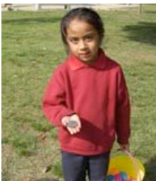
Left - Lucky Winner