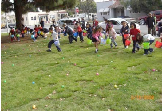
2008 Easter Egg Hunt

Ed Santiago started off the event by announcing the count down... 1-2-3. In less than 2 minutes, the children ran through the park with their colorful Easter buckets and collected all the eggs. After the children sat down near their buckets, eggs were distributed among the classrooms to make sure they shared their eggs equally with their less successful hunters and gatherers. Afterwards, each child took their own personal Polaroid picture with the Easter Bunny to keep as a memorable reminder of the festive day