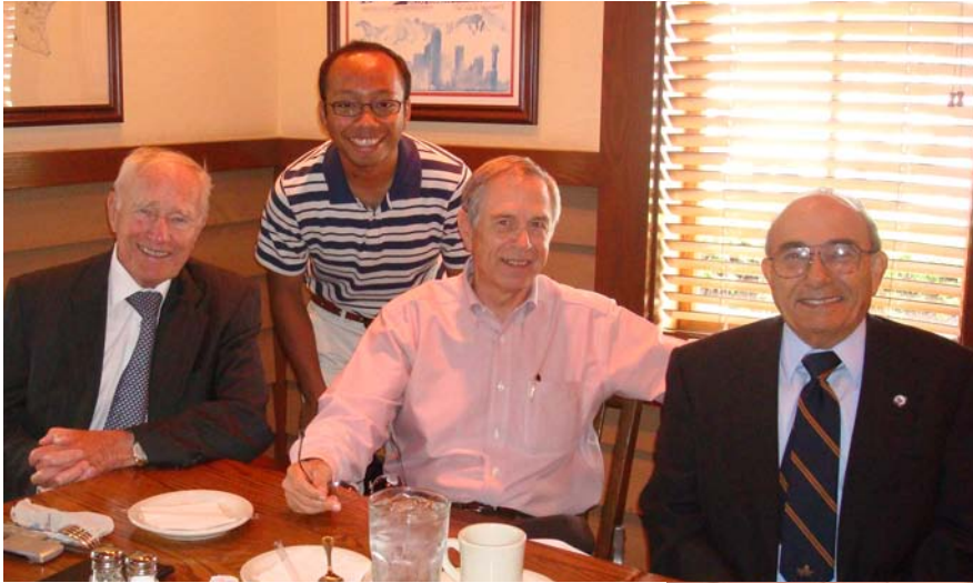
The Board Appreciation Lunch was enjoyed by all present.